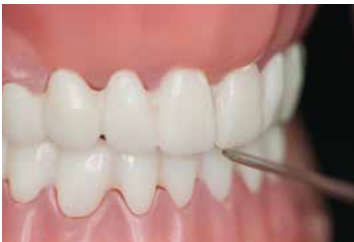
Check the accuracy of fit of the denture teeth and/or tooth sections before luting them. Correct any occlusal interferences directly on the teeth.