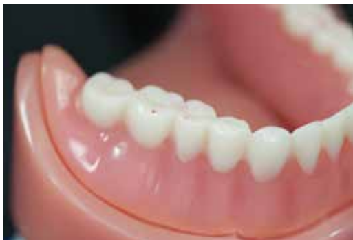
Grinding of early contacts.