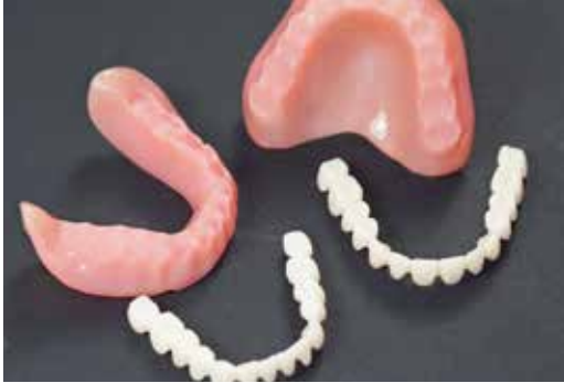
Denture base and teeth directly after production.