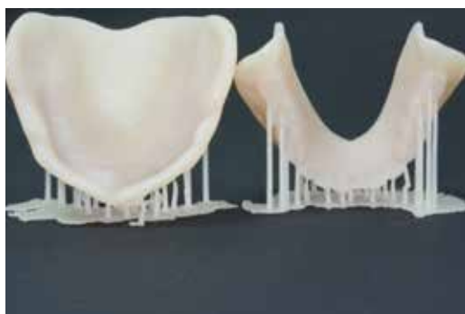
Try-ins made from V-Print Try-In incl. support structures.

Functionality, accuracy of fit and aesthetics are the be-all and end-all when it comes to dentures. In order to achieve perfect results, VOCO is now offering in V-Print Try-In a 3D printing material for functional trying-in of full and partial dentures. This makes it possible to assess the fit, occlusion, function, phonation and aesthetics before production of a permanent denture, for example, and allows corrections to be made using wax or veneering material if and as required. V-Print Try-In can be printed in thick layers and thus ensures a rapid and efficient process with accurate results. The production of transfer and grinding templates, correction impressions and occlusal impressions is also possible with V-Print Try-In.