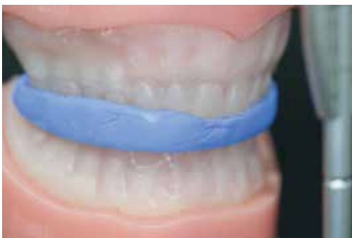
Example procedure for luting of the denture teeth to the denture base:

Ensure that none of the segments are tensioned.