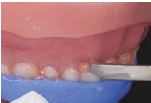
Removal of large quantities of excess material.