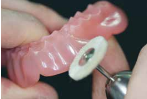
High-lustre polishing with goat's hair brush