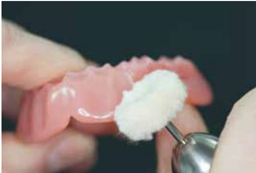
and cotton wobble.