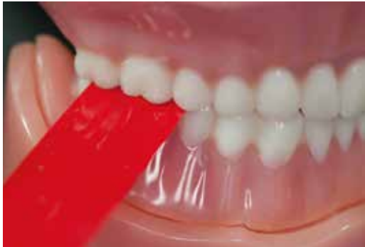
Checking the accuracy of fit using articulating paper.