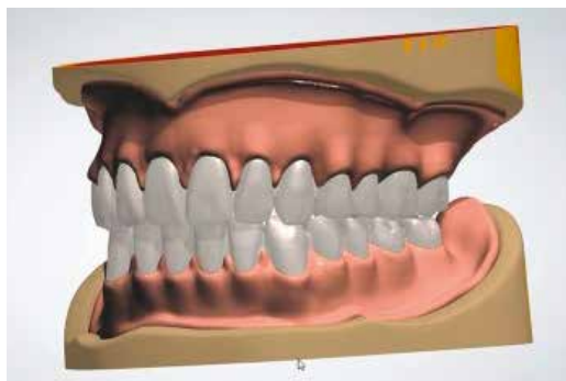
Before treatment: Digitally planned full denture