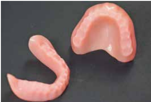
Finished denture bases.