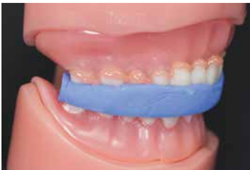
Uniting of teeth and base in articulator.