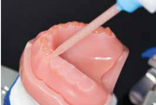
Application of CediTEC Adhesive.