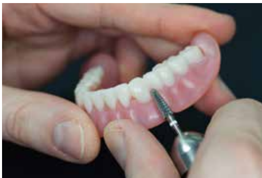
Following polymerisation, remove large quantities of excess material with fine-cut metal burs. Then use finishing diamonds and flexible polishing discs, for example, to sculpt the sulcus (sulcus gingivae – area between the tooth neck and the gum) and the interdental spaces. Polished areas are not included in the processing.