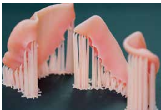
3D-printed denture base made from V-Print dentbase.

A perfectly fitting and aesthetically pleasing denture is not only indispensable for optimal masticatory function and normal speech – it often also gives the patient a completely new quality of life. The 3D printing material V-Print dentbase allows the production of optimally precise denture bases for removable dentures. Unlike conventional production, additive production does not involve shrinkage and so patients and dentists alike benefit from an accurately fitting result. As a consequence, there are fewer pressure spots and fewer check-ups are required, relieving the burden on both the patient and the dentist. V-Print dentbase is also compatible with all conventionally available lining materials. The material's shade supports natural aesthetics. For further optimisations, the base can also be customised and characterised with composites.