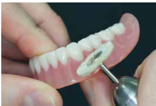
Polishing with goat's hair brushes.