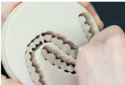
Detachment of milled dental arches with suitable tools such as carbide burs.