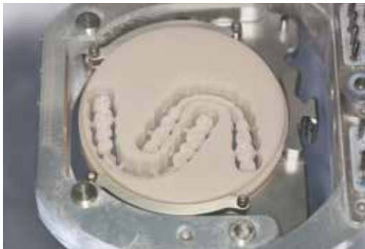
Milled dental arches in disc holder (here vhf).

CediTEC DT is a blank for the production of highly aesthetic permanent denture teeth for removable dentures. CediTEC DT contains 27% by weight inorganic fillers in a polymer matrix. Thanks to the composite technology, the material displays high abrasion resistance as well as high fracture resistance. CediTEC DT is suitable for both dry and wet processing. Select the corresponding blank size and the grinding/milling parameters for CediTEC DT for the designed restoration. When doing so, pay attention to the software settings of the respective CAD/CAM systems. "Diamond-coated tools" and composite parameters are recommended for the CAM processing. If the grinding/milling parameters are not already available in the CAD/CAM systems' software settings, they will need to be added before you proceed. Please contact the CAD/CAM system provider for assistance. The instructions for use from the manufacturers must be observed and followed.