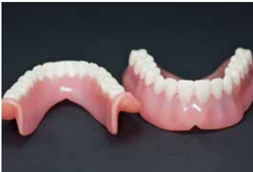
Checking the accuracy of fit between the denture bases. Correct any occlusal interferences directly on the teeth.